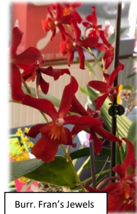
Burr. Fran's Jewels