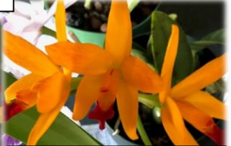
Slc. Kagaribi Dawn Lc. Trick or Treat