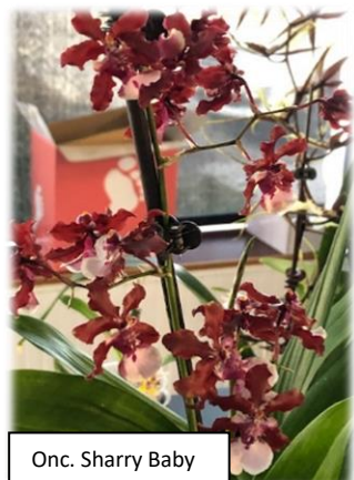
Onc. Sharry Baby