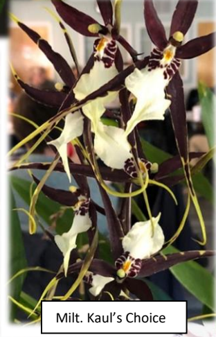
Milt. Kaul's Choice