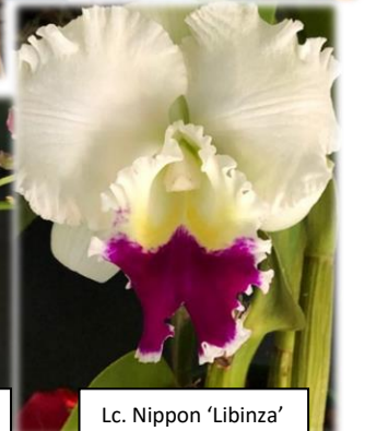
Lc. Nippon 'Libinza'