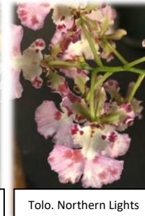
Tolo. Northern Lights