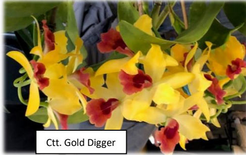
Ctt. Gold Digger