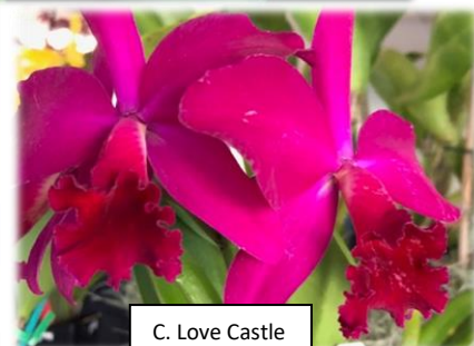
C. Love Castle