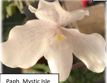
Paph. Mystic Isle