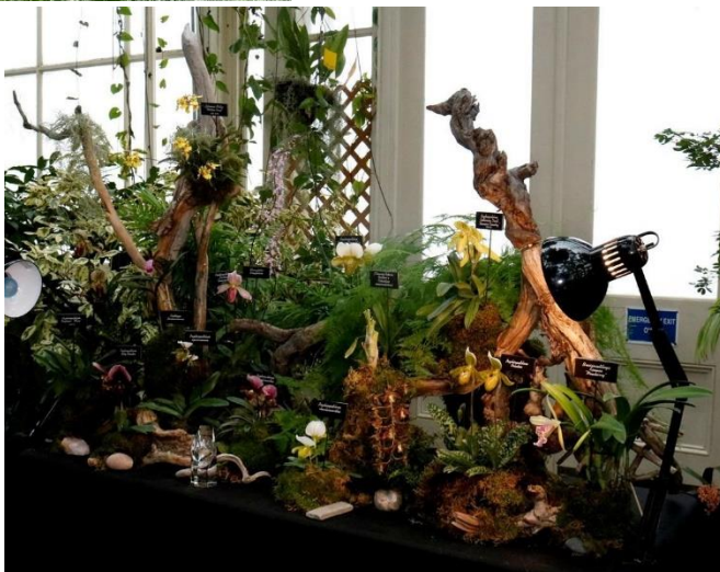
American Orchid Society Show Trophy 'Howard P. Martin' ST | AOS (83 points)