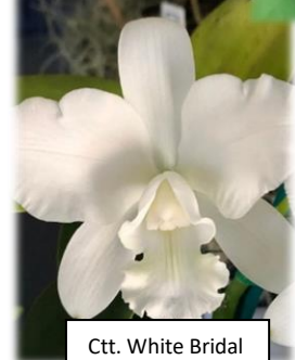
Ctt. White Bridal