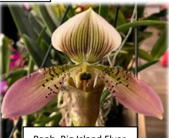
Paph. Big Island Flyer