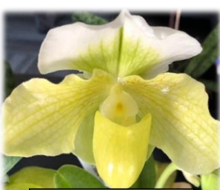
Paph. Baroness Byford