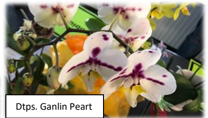
Dtps. Ganlin Peart