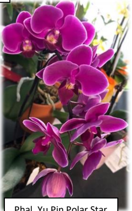
Phal. Yu Pin Polar Star