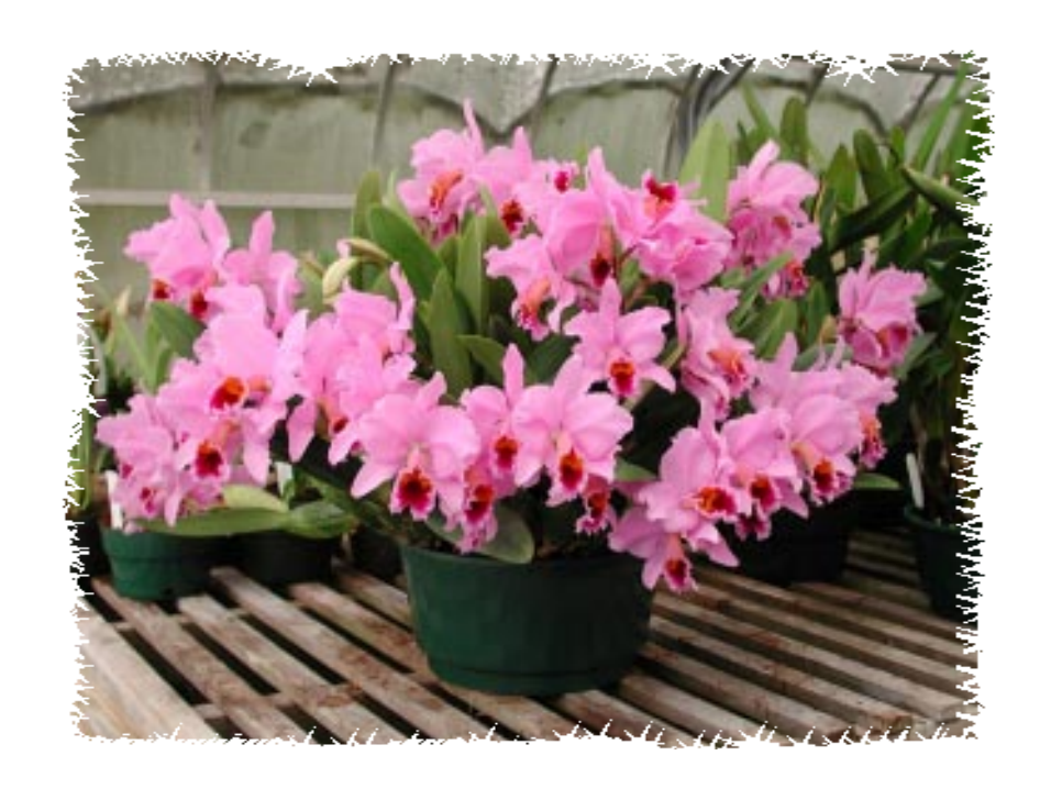
Cattleya Perciviliana 'Summit' FCC/AOS

Bergman Orchid Farm Bird's Botanicals Oak Hill Gardens r.f. Orchids Windy Hill Gardens Whippoorwill Orchids