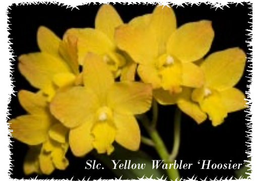
Slc. Yellow Warbler 'Hoosier'

the objectives of judging is encouragement and enjoyment of the hobby, show judges award ribbons fairly freely and sometimes award multiple