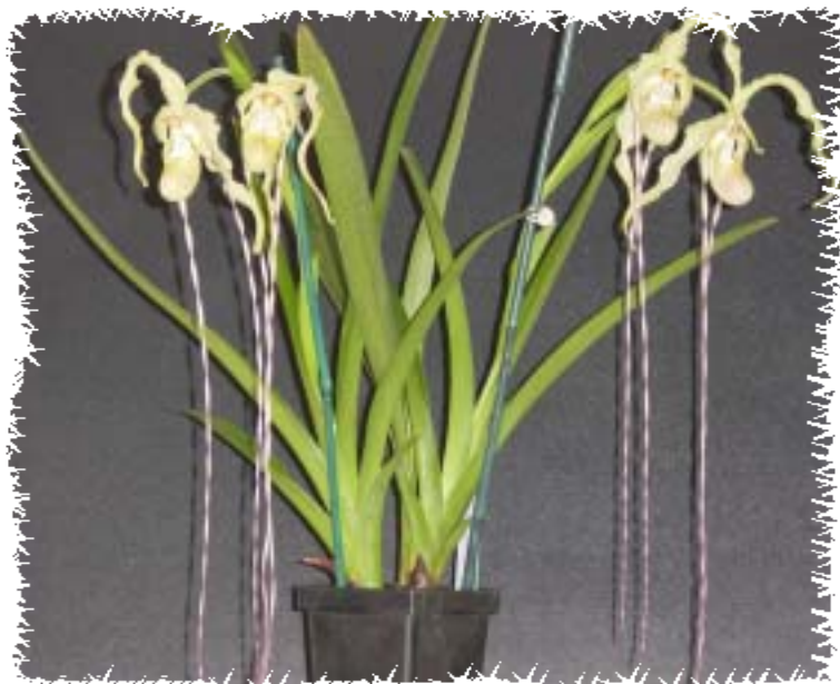
Phrag. Green Dragon

Many growers emphasize good water quality-rainwater,