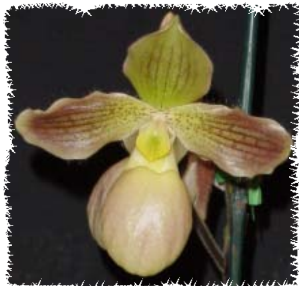
Paph. Satin Smoke

Phrags prefer intermediate temperatures, but bessae and schlimii tend to like it somewhat cooler.